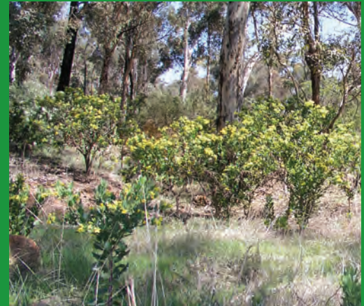
Boneseed invading native eucalypt woodland, Wandering WA.