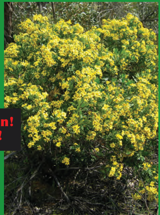
Close-up of flowering boneseed plant.

These weeds threaten native vegetation! You must control them on your land!