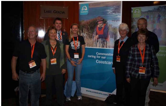
National Coastcare Award finalists