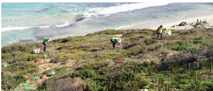
Stirling Natural Environment Coastcare planting at North Beach