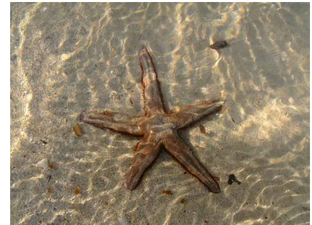
Winner Student Category: Oceana Scarrott