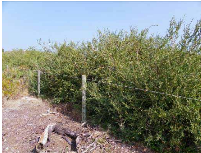
Coastal Tea Tree within the Town of Cambridge