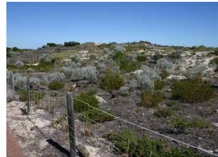
Tea Tree site 7 months after removal and planting