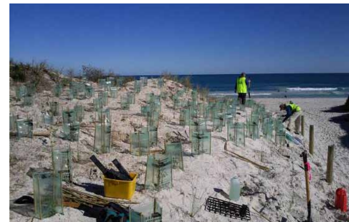
Joondalup Coastcare planting at Mullaloo Beach