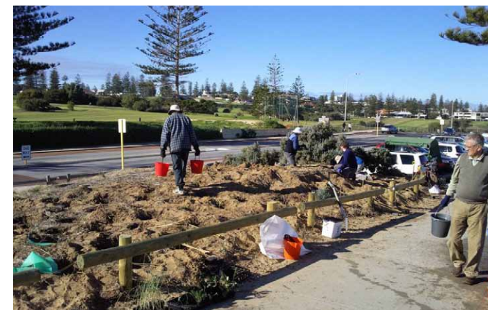
Cottesloe Coastcare planting at Mudurup Rocks