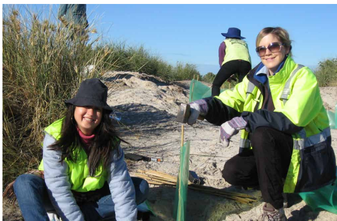
Community Coastcare volunteers planting at Coogee Beach, Cockburn.