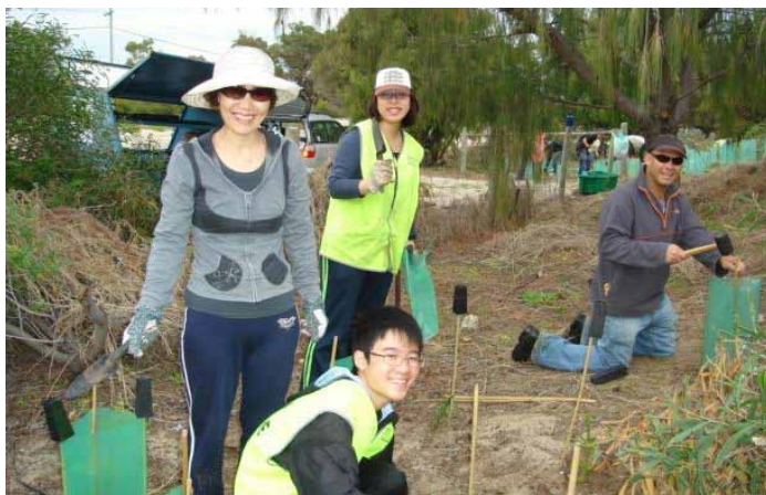
Community Coastcare volunteers planting at Kwinana Beach, Kwinana.

While each project site has its own challenging aspects, one of the biggest this year for all sites is the late arrival of significant rain! This means that groups have either chosen to delay planting until the ground is a little wetter, or have been hand-watering their seedlings to give them a good start – which can be very time-consuming. All volunteers should be congratulated on putting such a huge effort into the planting season this year!