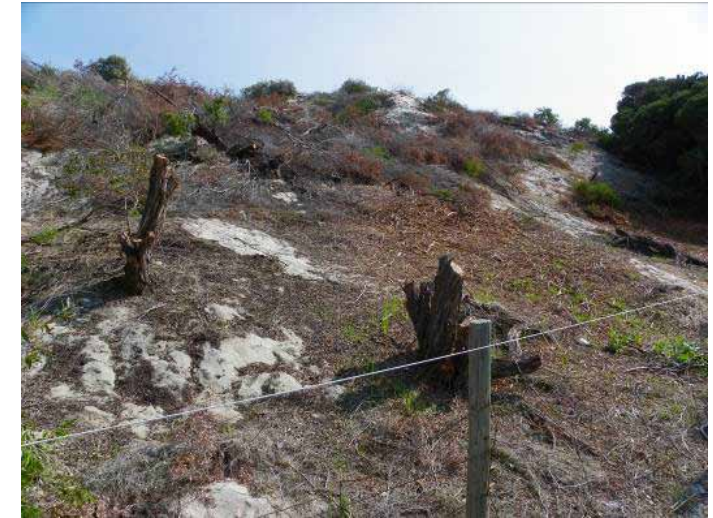
After Tea Tree removal

Cambridge Coastcare members and volunteers are this winter planting local dune species in the areas where the Tea Tree has been removed.